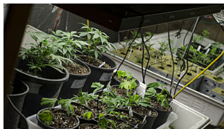
CANNABIS STARTUPS NEED A CO-WORKING SPACE TOO