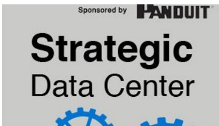
DATA CENTERS FLOURISH IN IOWA ( Building the Strategic Data Center | Transform your data center into a strategic asset )