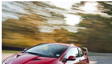
7 HOT HATCHES THAT WILL CHANGE HOW YOU THINK ABOUT HATCHBACKS ( Learnist )