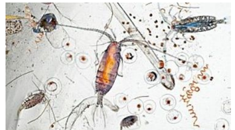
A SINGLE DROP OF SEAWATER, MAGNIFIED 25 TIMES