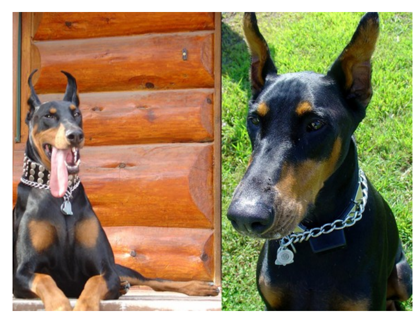
Doberman Pinscher Duke's before- and after- shots with ear implants.